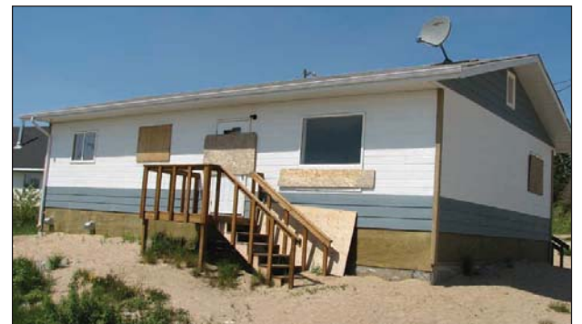
Private Member's Bill to implement the Kelowna Accord would inject dollars to battle the housing crisis on Manitoba First Nations.

Bill C-292, known as the Kelowna Accord Implementation Act, passed in the House of Commons with a vote of 159 to 123.