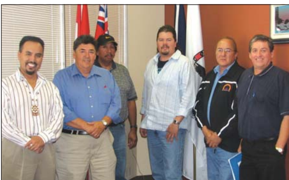
SCO Chiefs' Executive Committee 2005-2006