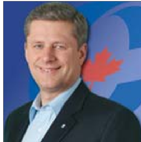
Prime Minister Stephen Harper

• Pursue settlement of all outstanding "comprehensive claims" within a clear framework that balances the rights of aboriginal claimants with those of Canada.