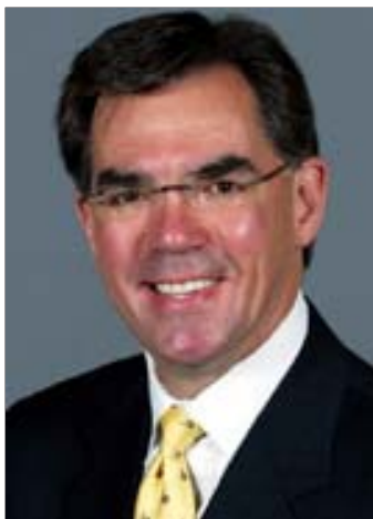
Minister of Indian Affairs and Northern Development, the Honourable Jim Prentice

I was honoured and privileged in February 2006 to be asked by Prime Minister Stephen Harper to serve as the Minister for Indian Affairs and Northern Development (the government department is called INAC, which stands for Indian and Northern Affairs Canada). I served as the Opposition Critic for this portfolio from July 2004 to January 2006.