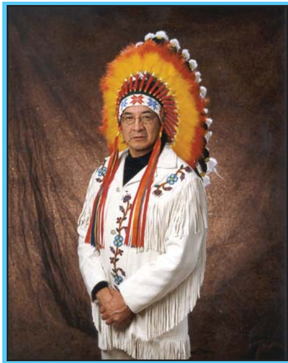
Manitoba's First Treaty Commissioner