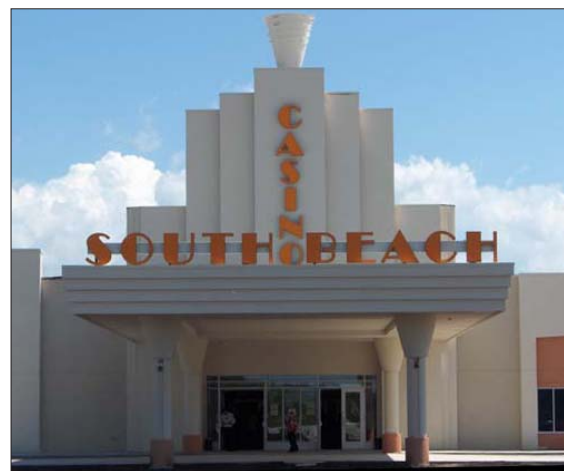
South Beach Casino official Grand Opening - June 22, 2005.